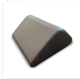
Triangle Cushion Helps relieve pain through blood circulation