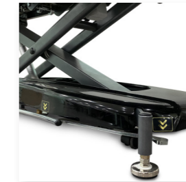
4-side Elevation Bar Total 8 up/down bars on 4-sides to adjust the height in any position