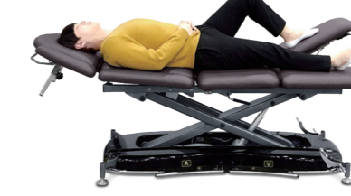
Leg rehabilitation position