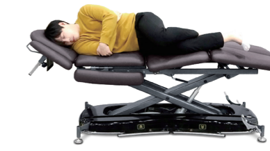
Back rotation exercise position