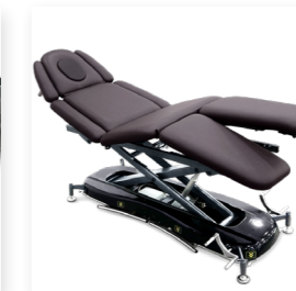
Versatile Positions The 10 section provides versatile treatment position