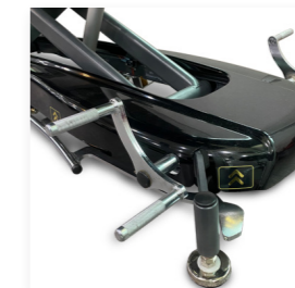
Total Lock Castor Fix and move the all castors at once