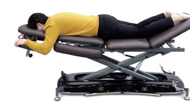
Back extension exercise position